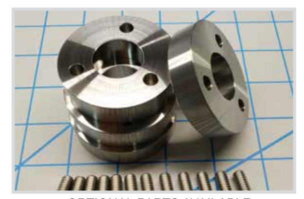
> OPTIONAL PARTS AVAILABLE