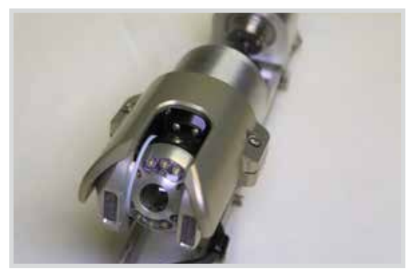
> CURRAHEE CUTTER CAMERA